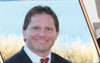
Presented by: Jerome Rerucha, BS, CSCS, DC